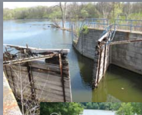
◀ Combined Locks Lower Gate May 2008