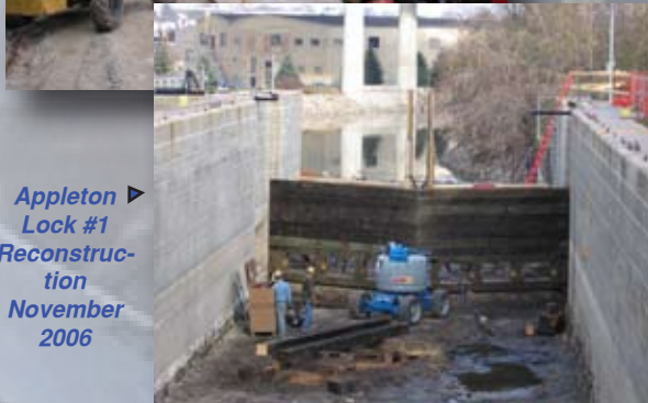
Appleton ▶ Lock #1 Reconstruction November 2006