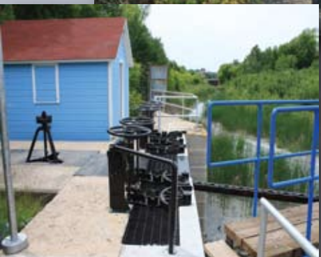
◀ Little Chute Locktender Shed June 2009