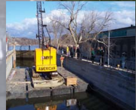
News Conference Appleton #4 Lock Completed! December 2006