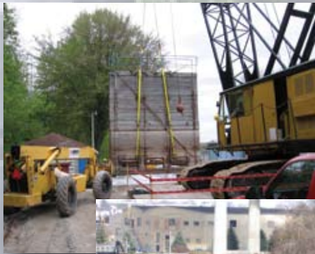
◀ Fox Locks reconstruction begins! Gate removal Appleton Lock #1 May 2006