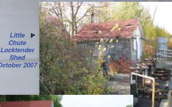
Little ▶ Chute Locktender Shed October 2007