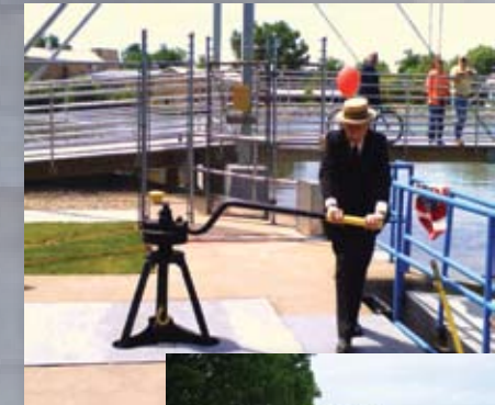
◀ Menasha Lock Trestle Bridge Dedication June 2006