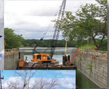
Appleton #4 Lock Removing Gate August 2006