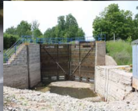
Combined ▶ Locks Lower Gate June 2009