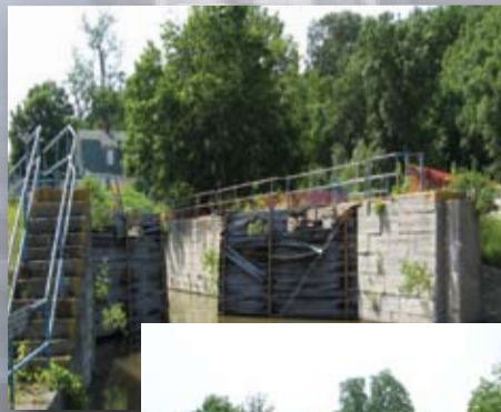
◀ Combined Locks Lower Gate July 2008